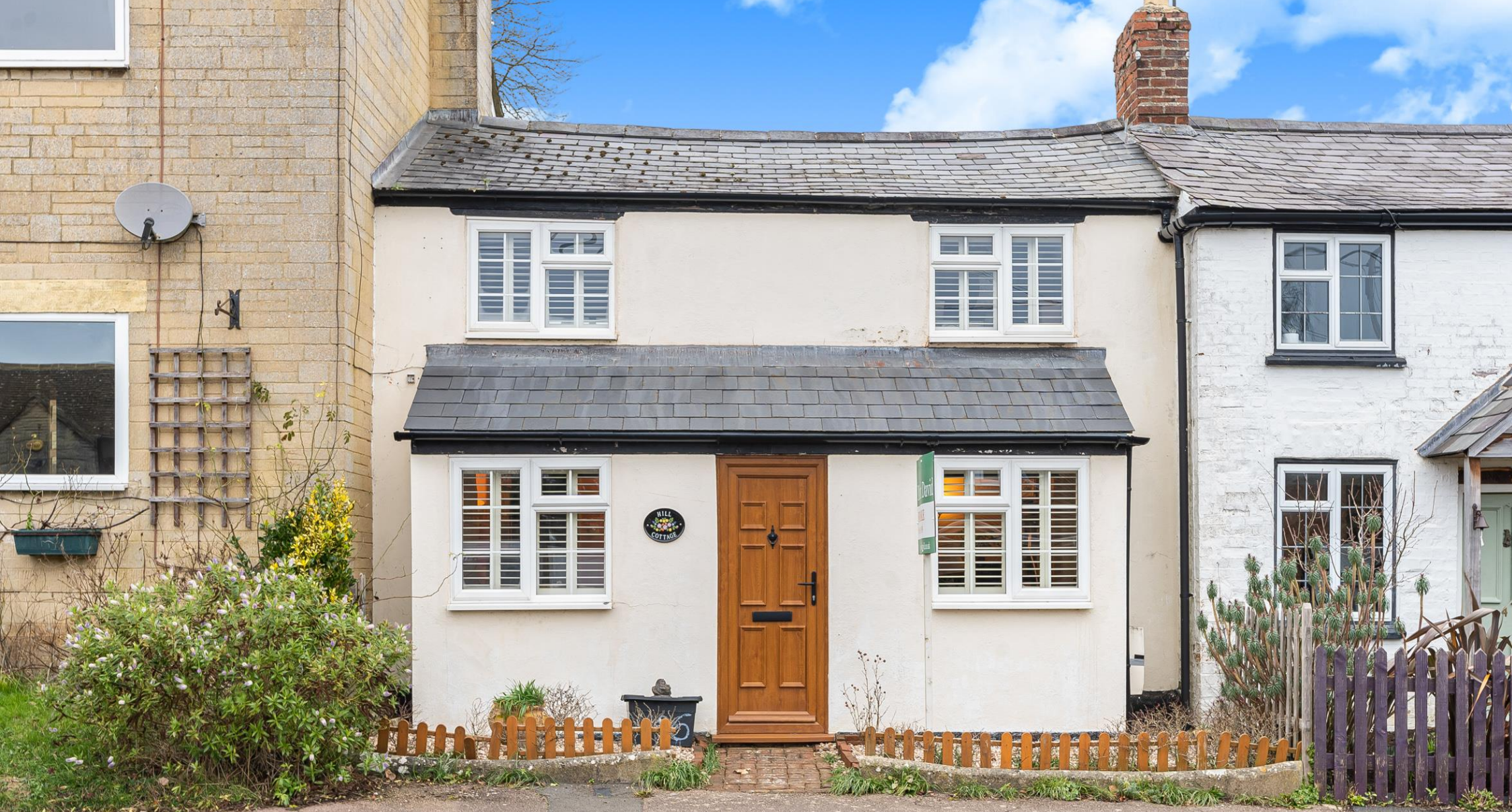
Hill Cottage, 6 Enstone Road, Middle Barton, Chipping Norton, Oxfordshire, OX7 7BN