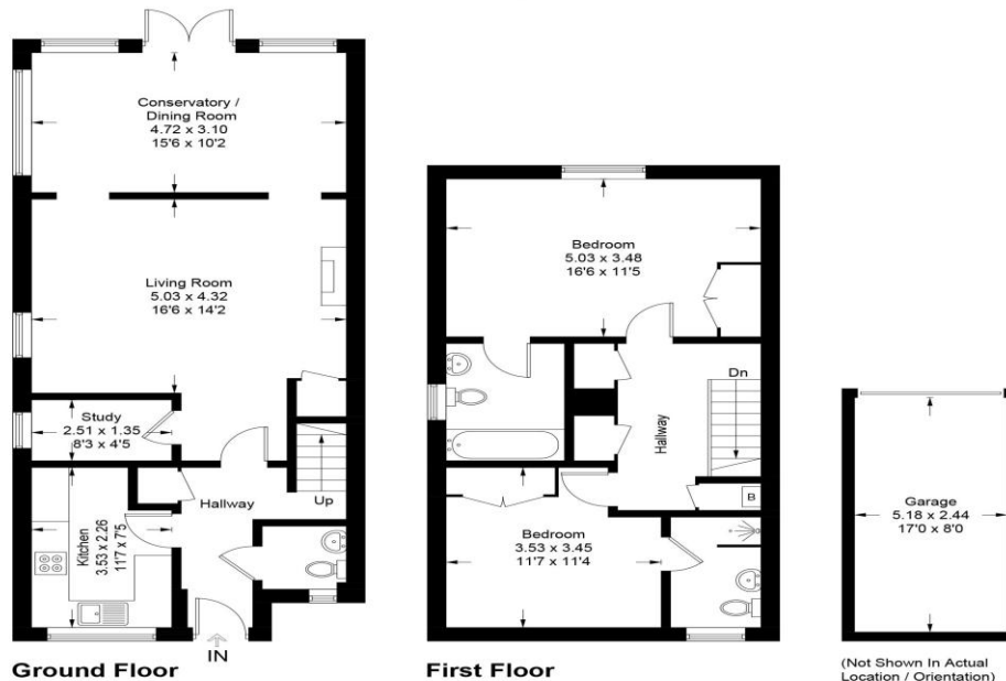
Illustration for identification purposes only, measurements are approximate, not to scale. Fourlabs.co © (ID1185711)

Approximate Gross Internal Area = 113.7 sq m / 1224 sq ft Garage = 12.7 sq m / 137 sq ft Total = 126.4 sq m / 1361 sq ft