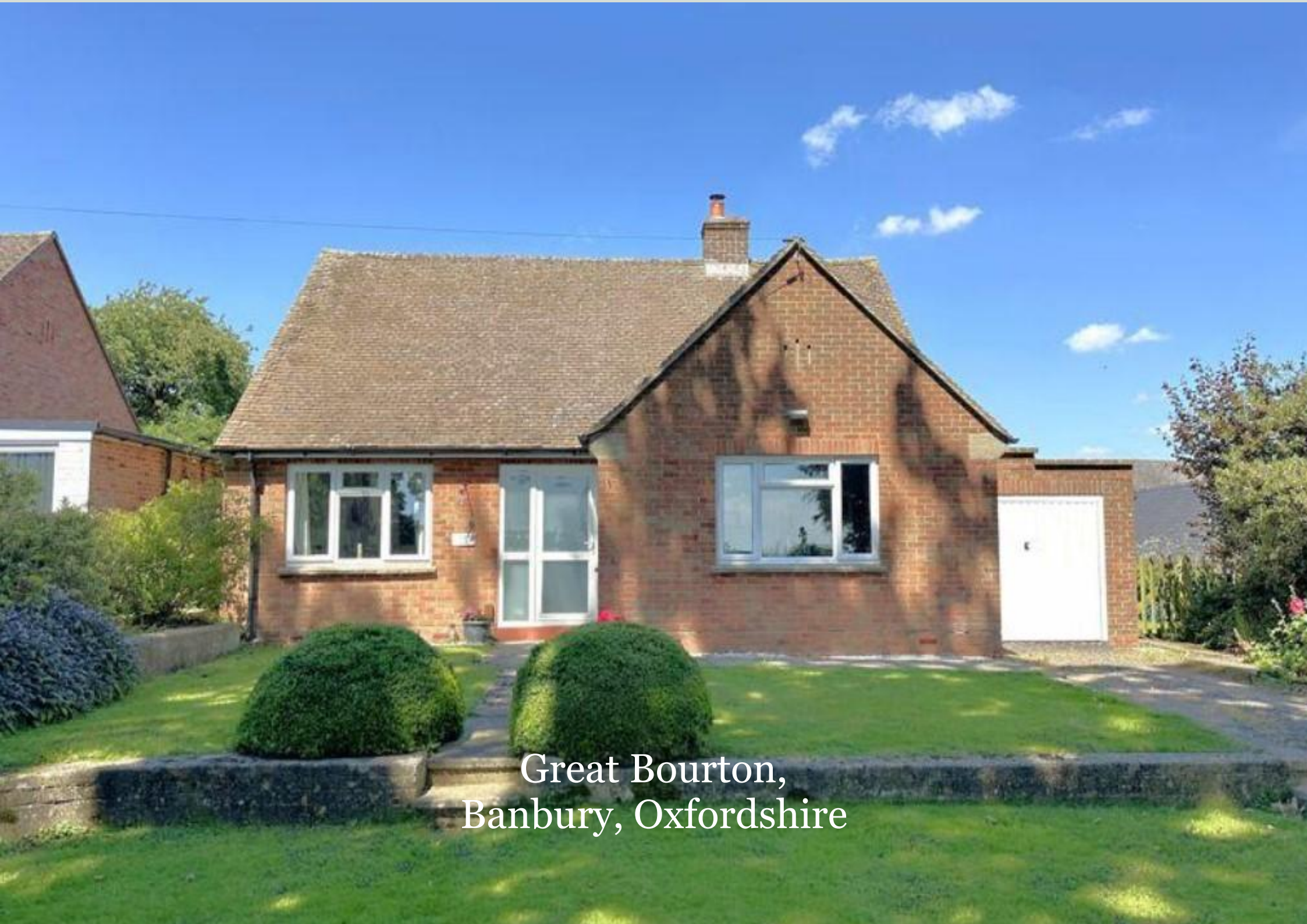
Great Bourton, Banbury, Oxfordshire