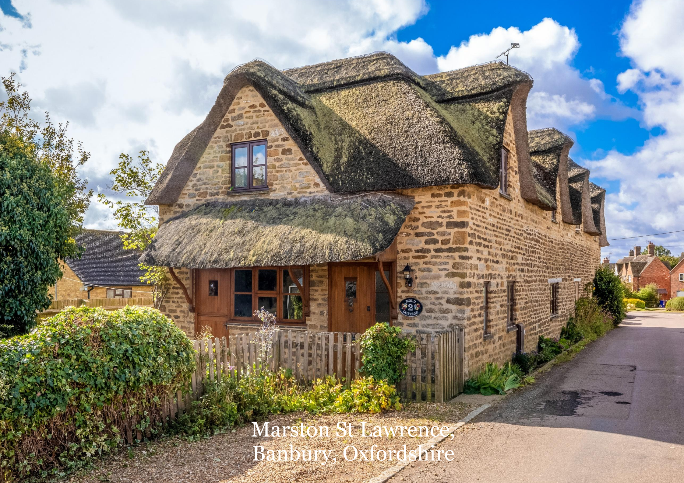
Marston St Lawrence, Banbury, Oxfordshire