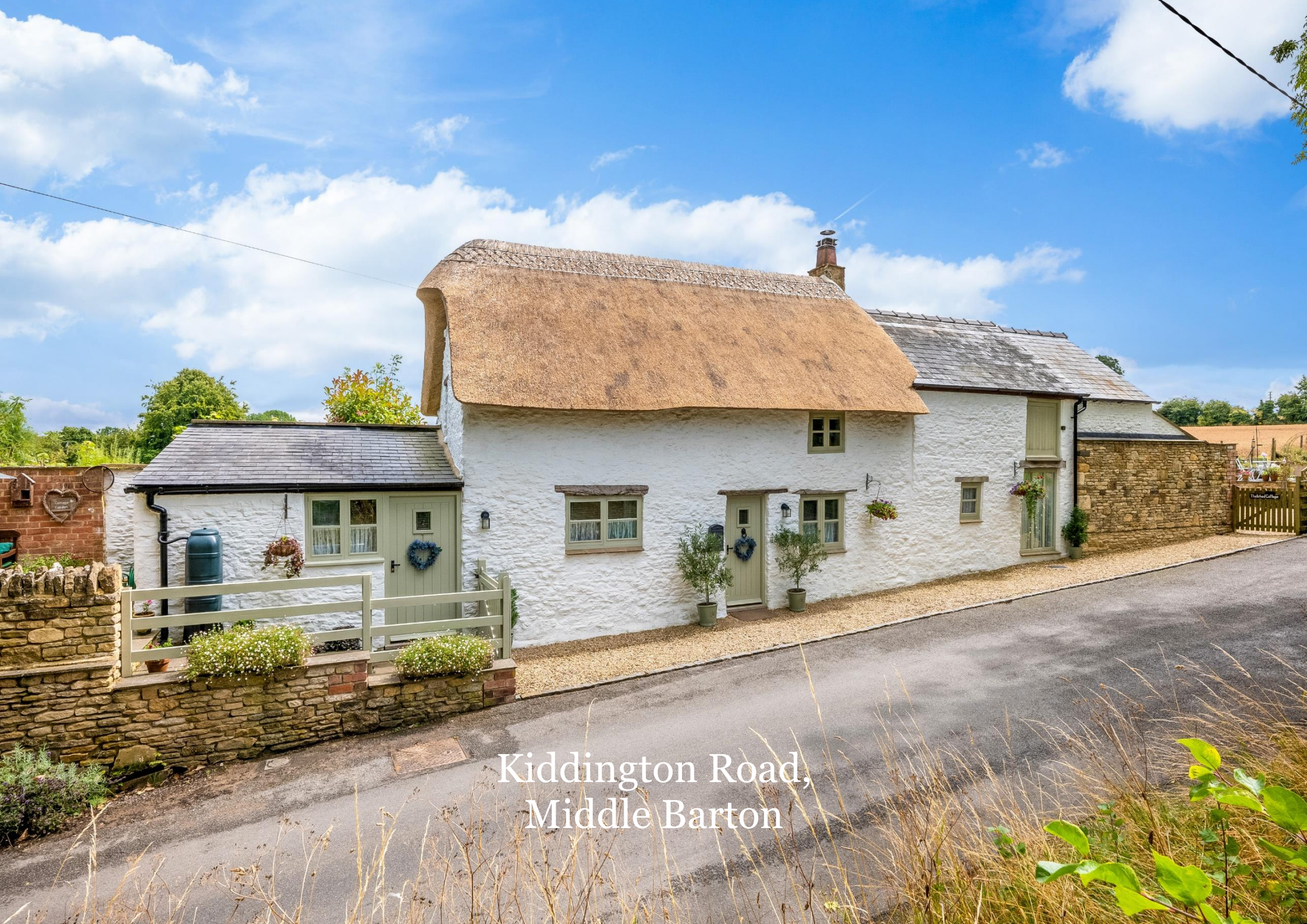
Kiddington Road, Middle Barton