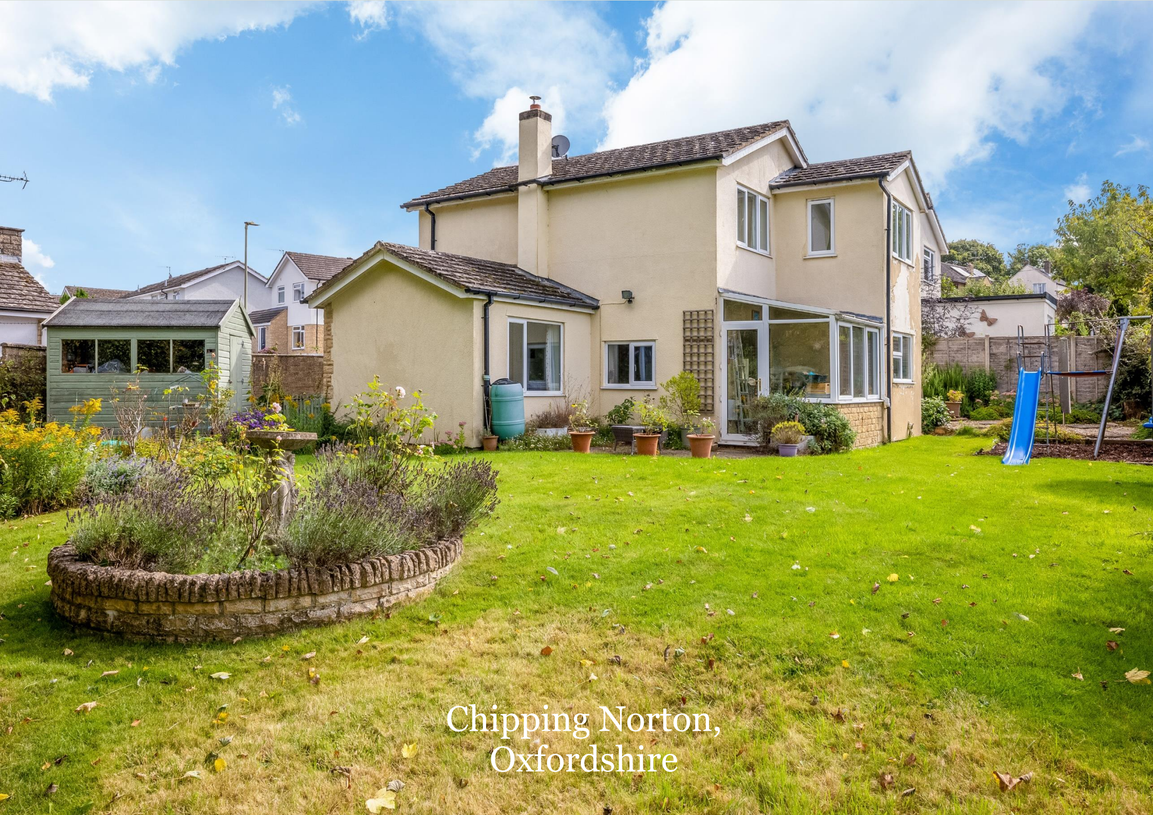
Chipping Norton, Oxfordshire