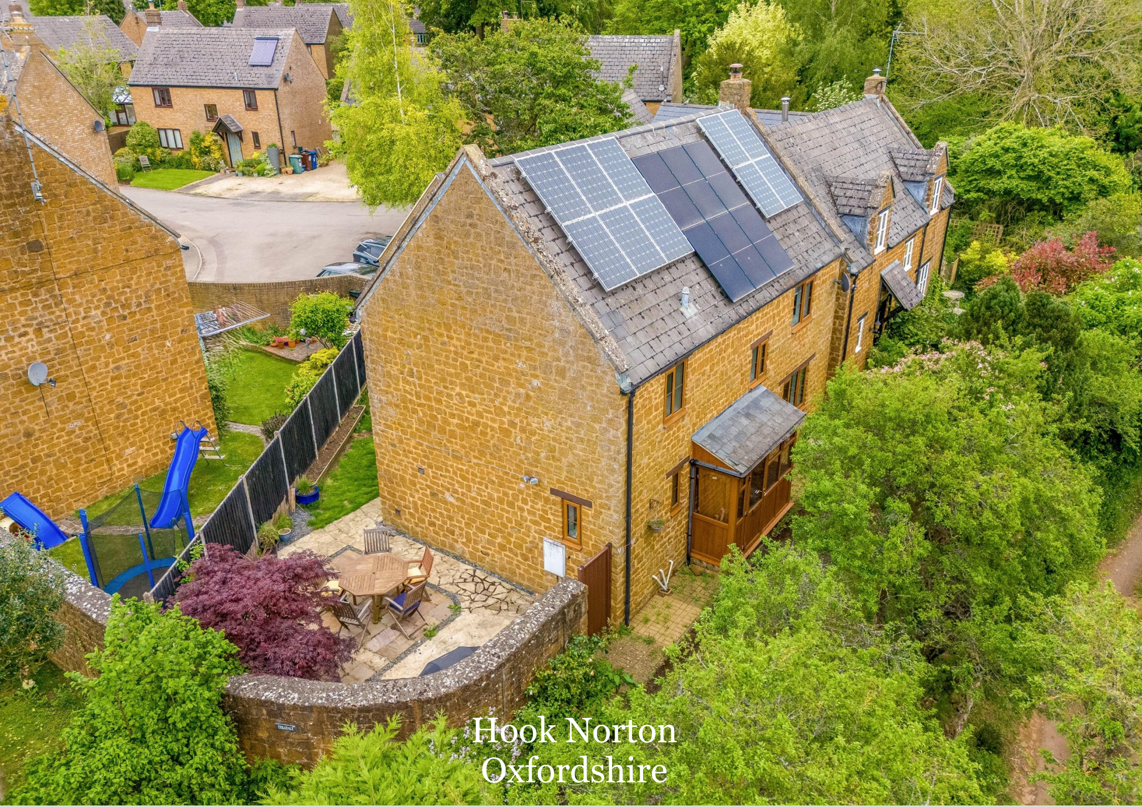
Hook Norton Oxfordshire