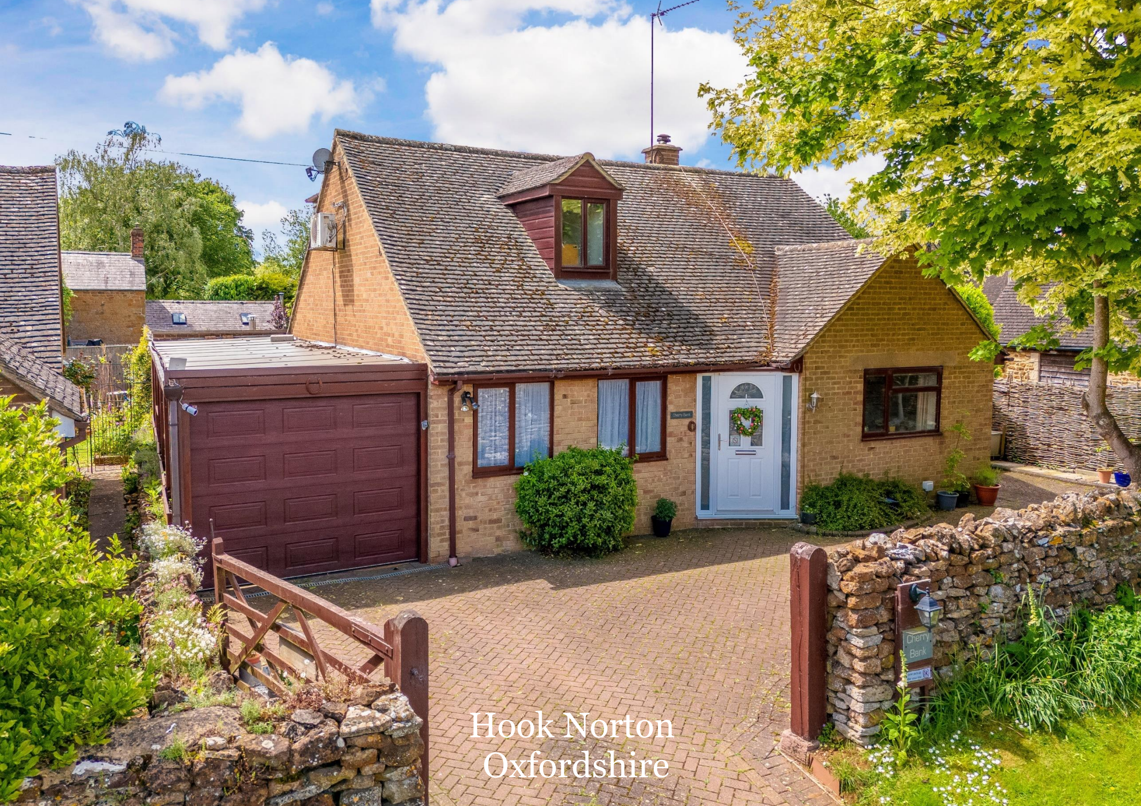
Hook Norton Oxfordshire