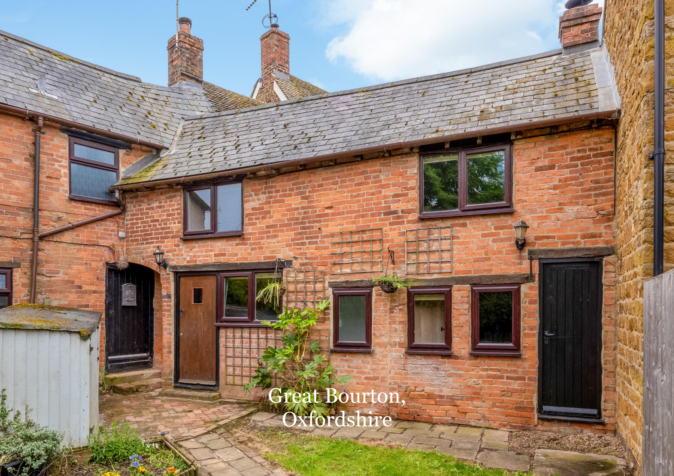
Great Bourton, Oxfordshire