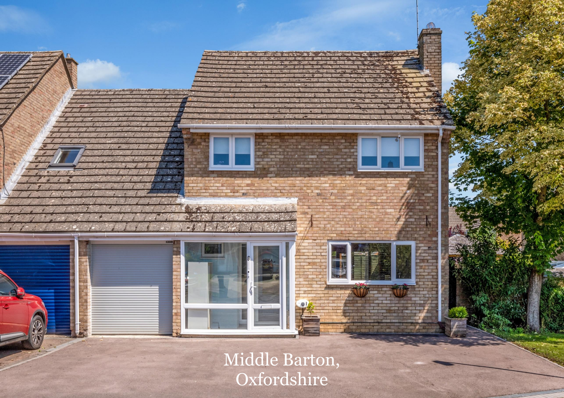
Middle Barton, Oxfordshire