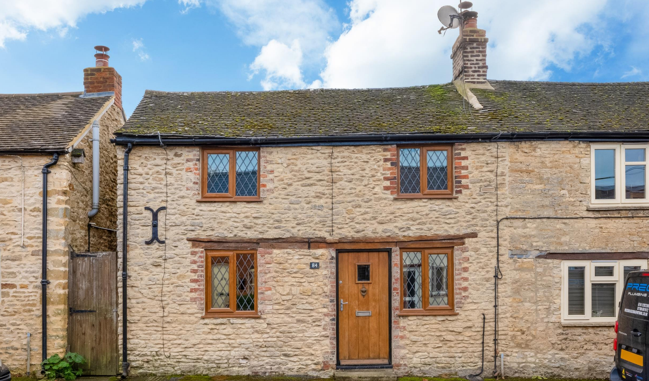
Middle Barton Oxfordshire