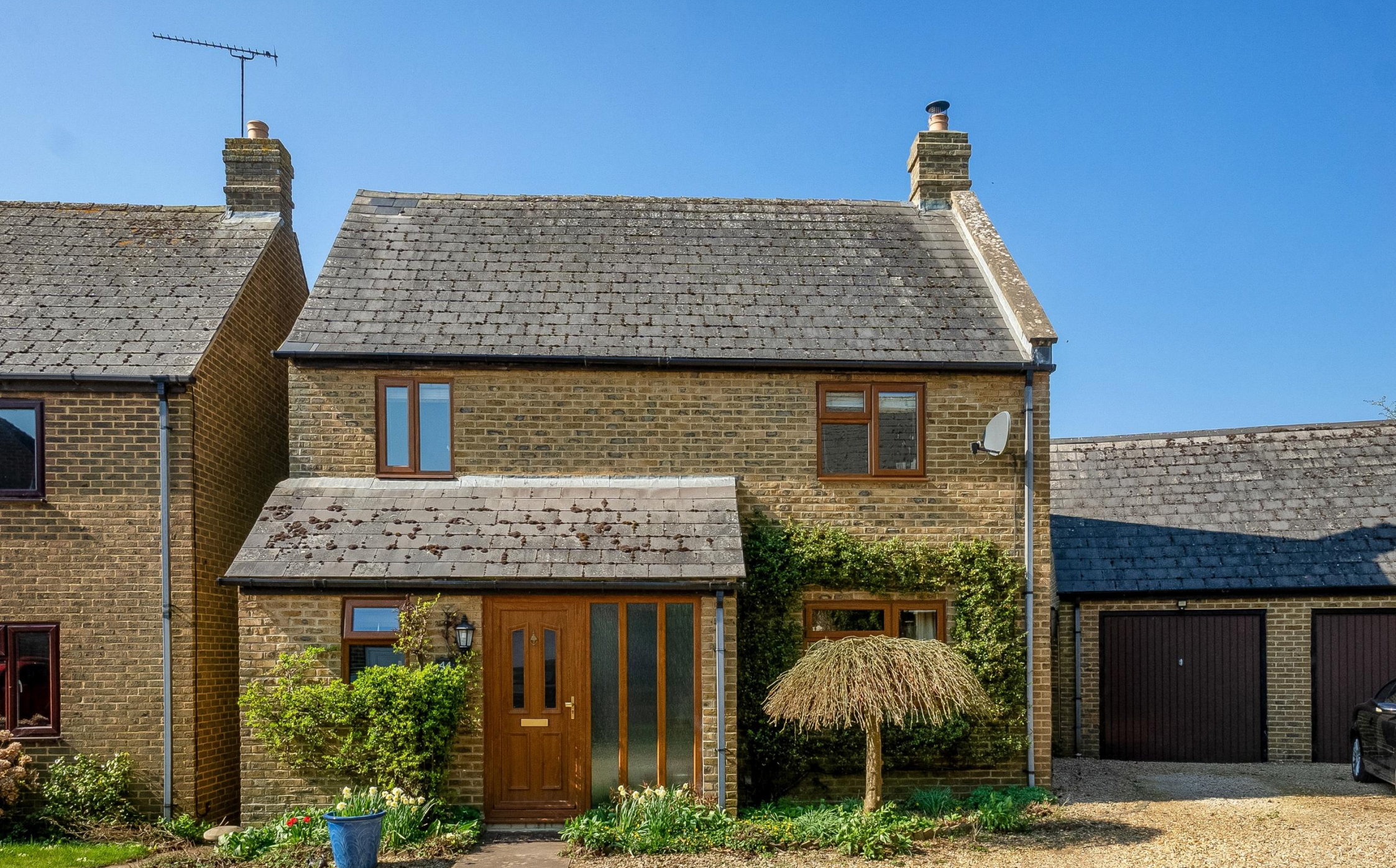
Hook Norton, Banbury, Oxfordshire