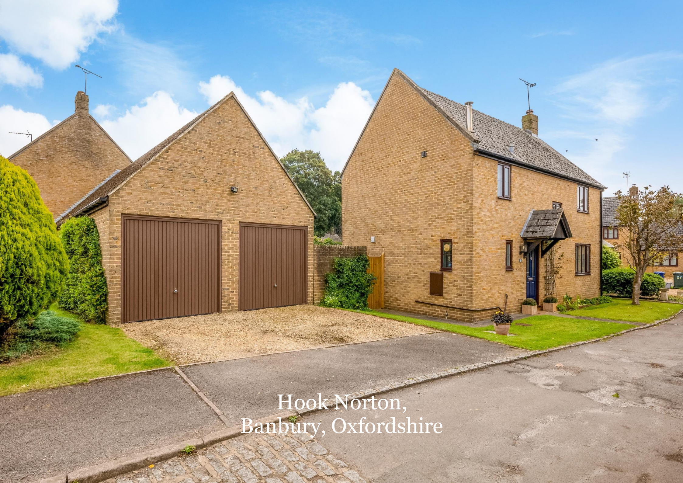
Hook Norton, Banbury, Oxfordshire