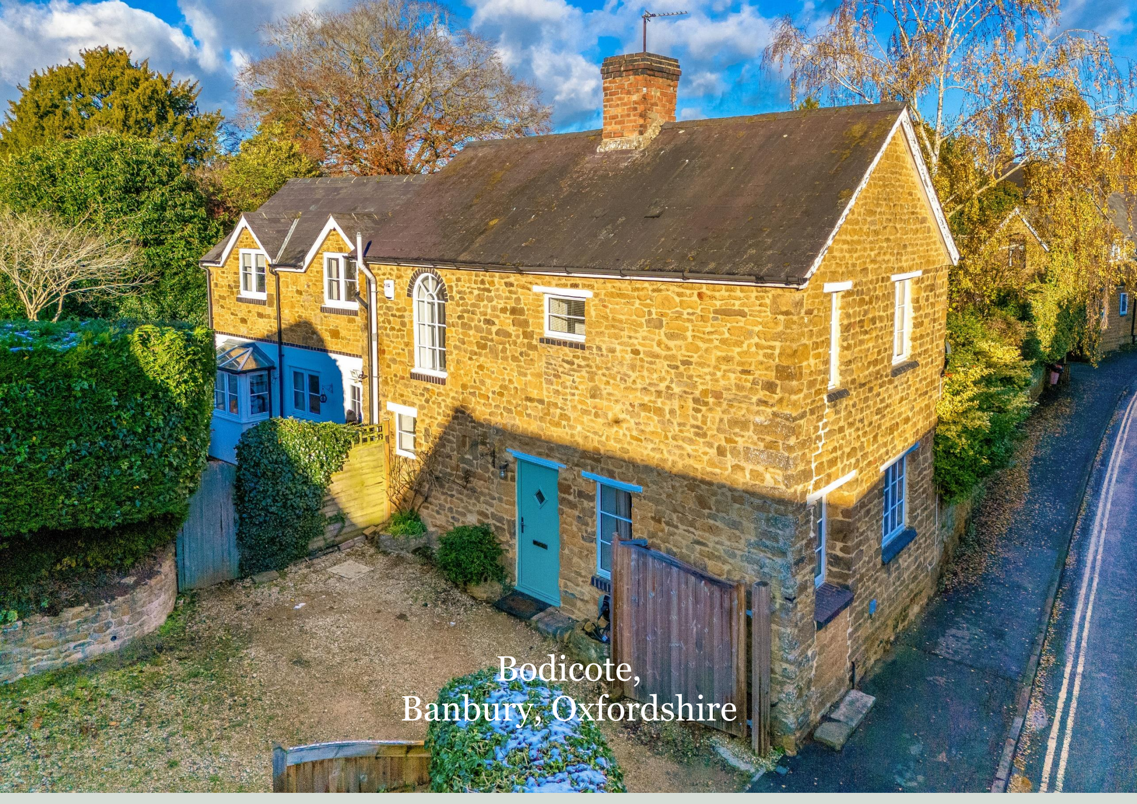
Bodicote, Banbury, Oxfordshire