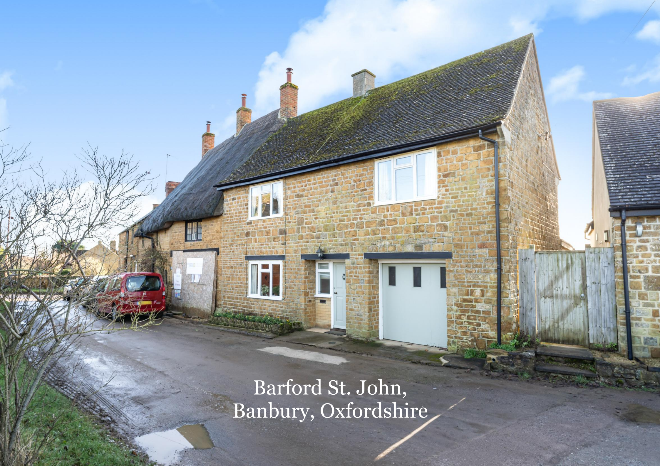
Barford St. John, Banbury, Oxfordshire